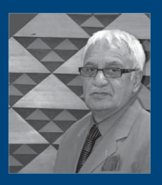
Taitimu Maipi Te Ohaaki Marae