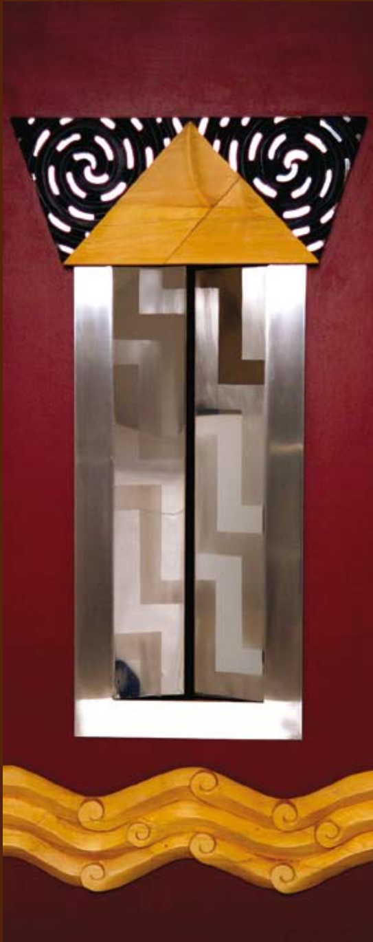
Ko Taupiri Te Maunga Ko Pootatau te Tangata Ko Waikato te Awa